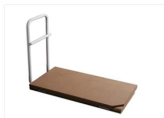
15062 Bed Assist Rail with Folding Board