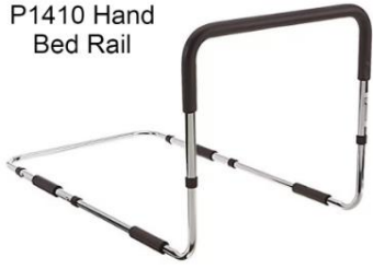
P1410 Hand Bed Rail