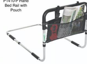
P1410-P Hand Bed Rail with Pouch