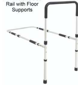
P1411 Hand Bed Rail with Floor Supports