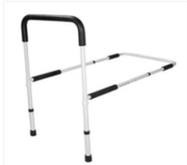
RTL15063-ADJ Home Bed Assist Handle