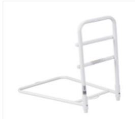
15064 Bed Assist Handle